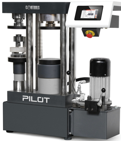
PILOT PRO mod.65-L28P12